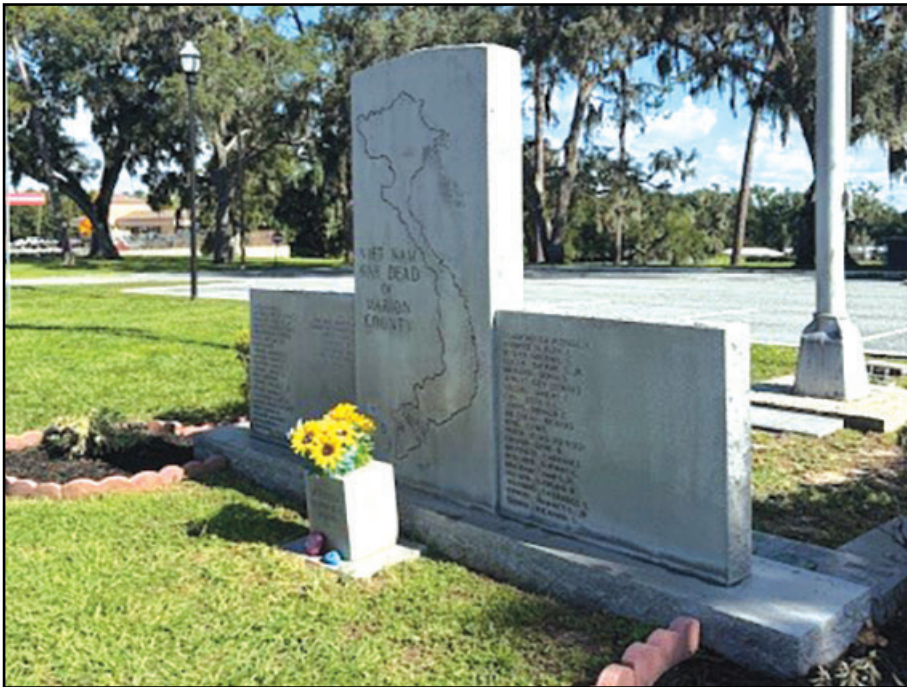
The Vietnam Veterans Memorial, located in front of Belleview City Hall

The City of Belleview extended its deepest thanks to St. Theresa Catholic Church, commending the parish for its servant leadership and continued efforts to build a stronger, more connected community.