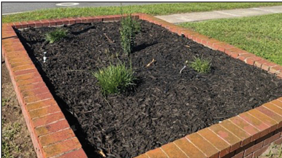
Refreshed flower bed near city hall entrance