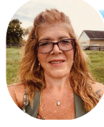
Views From A Small Town By Missi Branham

A major highlight of the day was the return of the Gregg Smith Automotive Car Show, which featured nearly 100 classic, modern, and specialty vehicles. The show continued to be a favorite attraction, drawing car enthusiasts from across the region for the second year in a row.